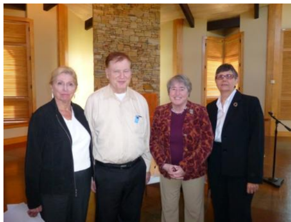
Speakers from Election Issues Forum

Thus, ACCR is urging voters to pass Amendment 4 to eliminate the racist language now, and to work next year to address the Education Article.