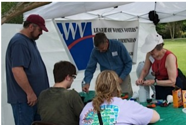
THE VOTER - May 2011