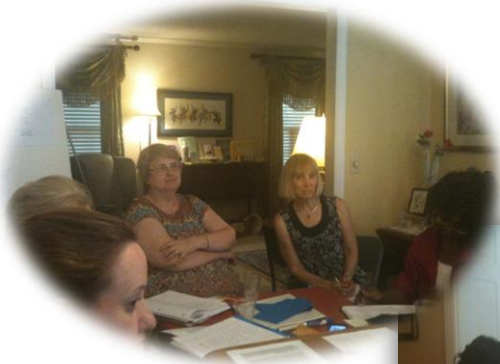
Photos from Board Planning Meeting, 11 June 2011