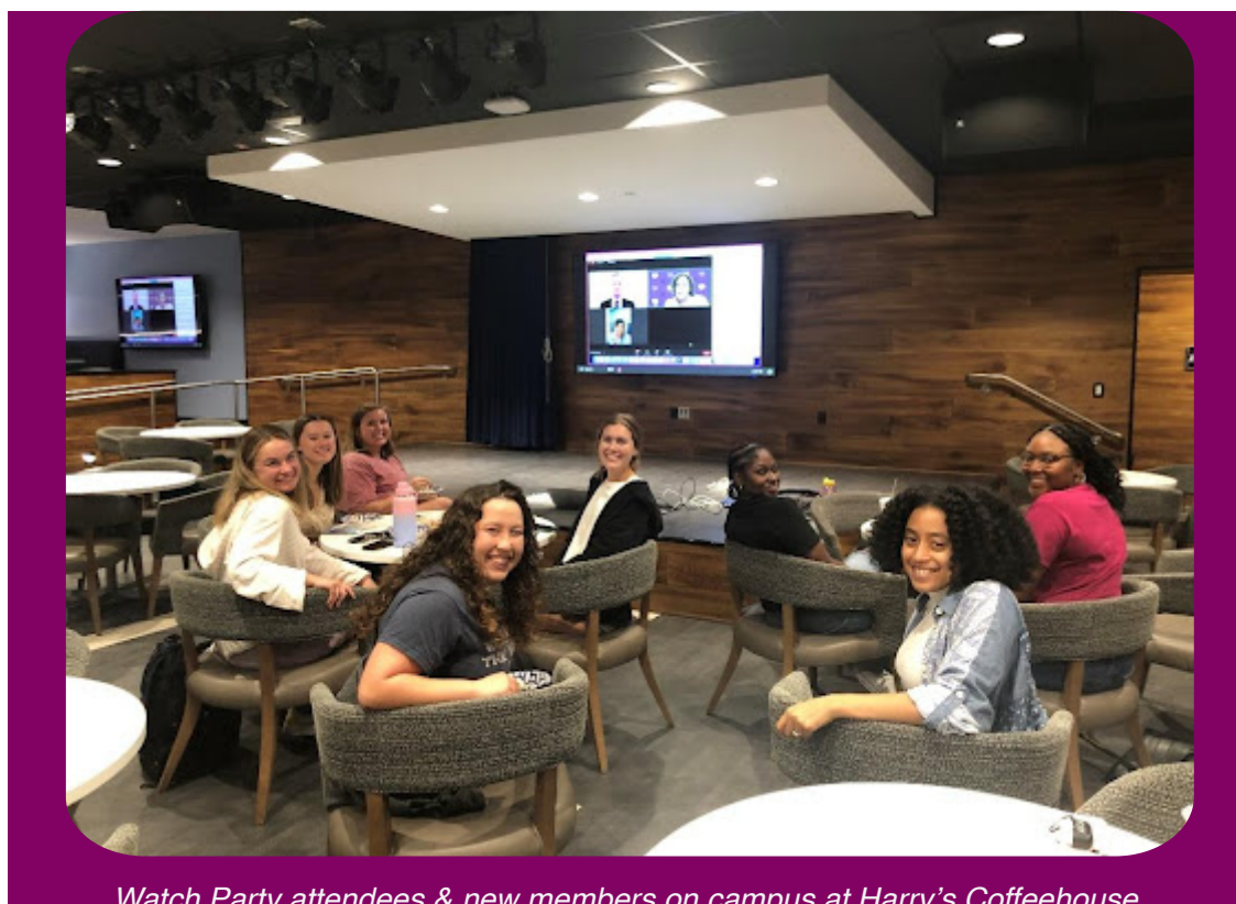
Watch Party attendees & new members on campus at Harry's Coffeehouse.

Science) moderate the Secretary of State virtual debate. This debate was sponsored by the LWV of Alabama and gave insight into issues and basics of a candidate forum.