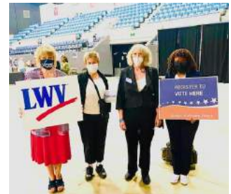
JeffCo 2 nd Chance Hiring Fair