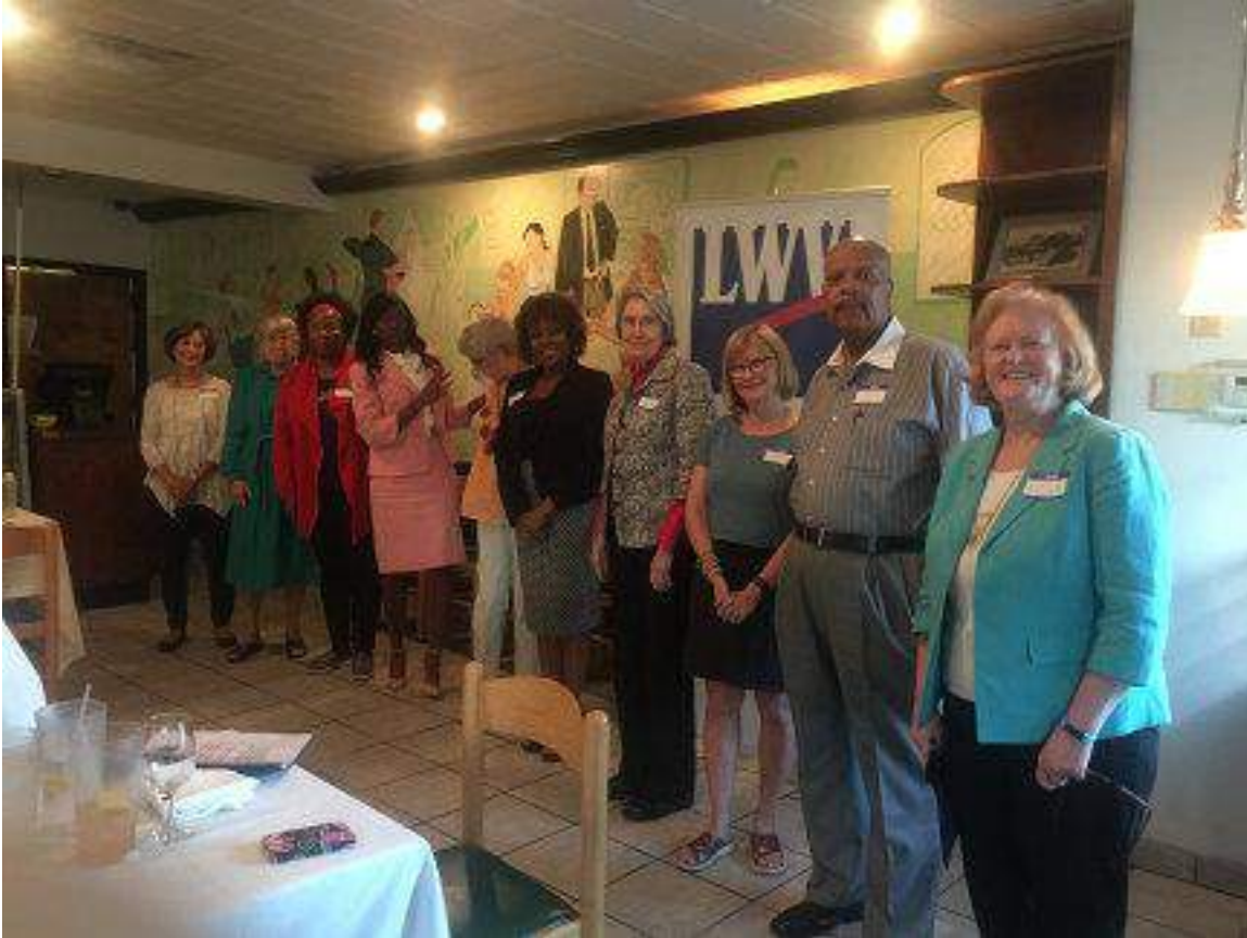
LWVGB Board of Directors, 2017-18