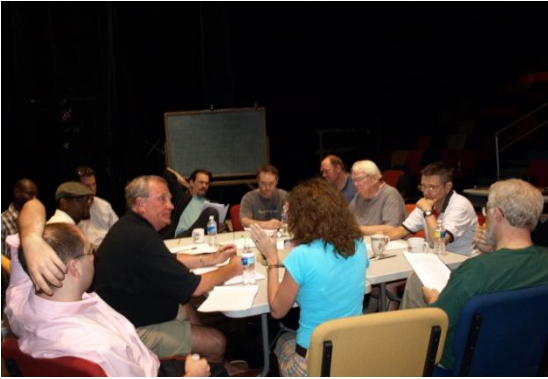
Actors practicing for the Constitutional Reenactment.